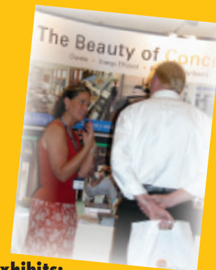
Exhibit Hours - Outdoor Exhibits:

A product demonstration component has been added this year for companies that select one of four sponsorship options above the general exhibit registration.